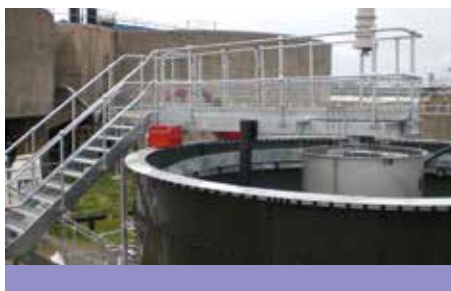
Adaptation to suit a broad range of tank types, sizes and structural forms.