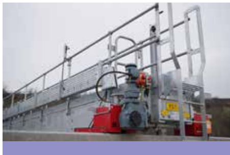
Drive traction improvement options including: Anti-slip running surfaces, heat lamps for winter operation and loss-of-motion detector on idle wheel.