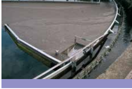
A range of scum removal and scum concentration equipment.