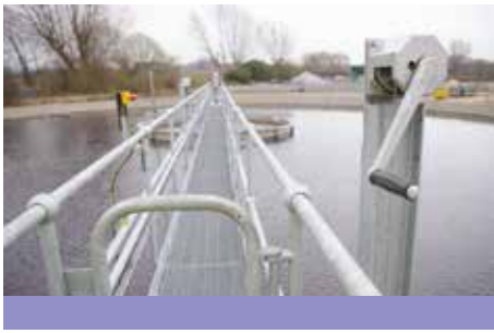
Bespoke access ladders, walkways, stairs and hand-railing to British standards.

A variety of optional features are available such as: