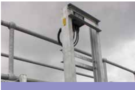
Fitments for sludge blanket detection equipment, torque monitoring equipment, lifting davits, drive carriage obstruction detectors and other instrumentation or components as required.