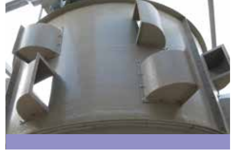
All manner of flow-controlling baffles for optimum settling conditions including Diffuser Drums, Stamford baffles, McKinney baffles and Energy Dissipating Inlet baffles (EDIs) complete with hydraulic design and modelling services if required.