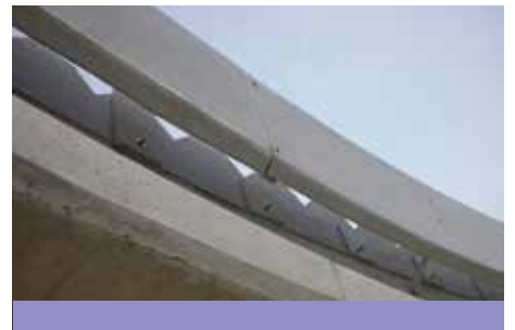
Tanks and their functional components in GRP or steel including scum boards, launders, weirs and covers.