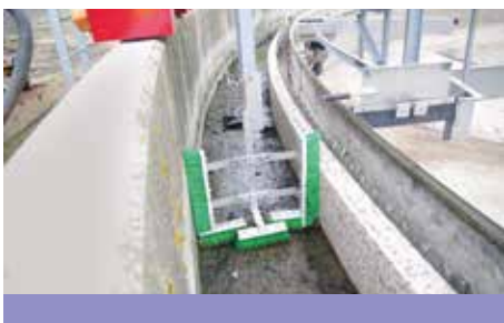
Winch-lifting weir and launder cleaning brush systems.